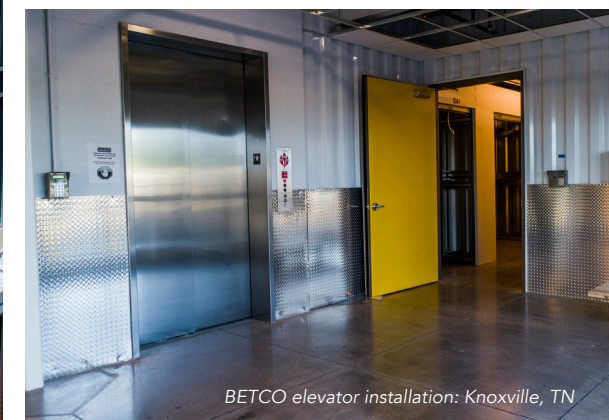
BETCO elevator installation: Knoxville, TN