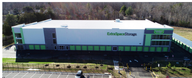
BETCO multistory installation: Stafford, VA