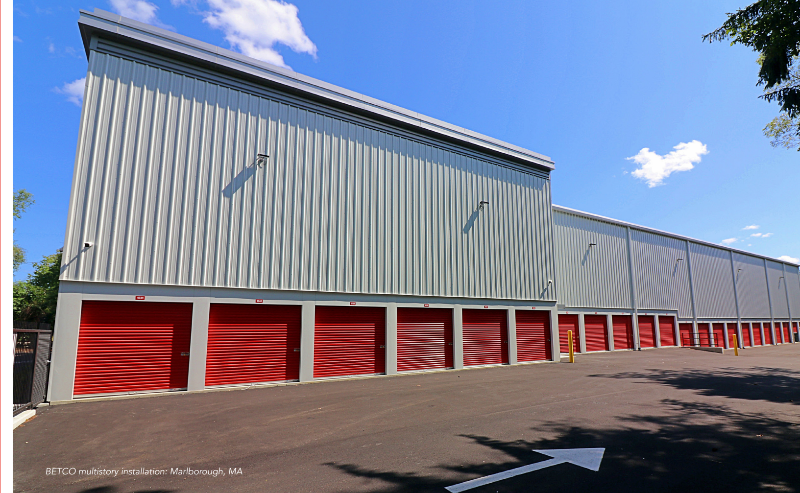
BETCO multistory installation: Marlborough, MA

We use the latest technology in our design and manufacturing processes and always consult with you about new technology that could benefit your project's success.