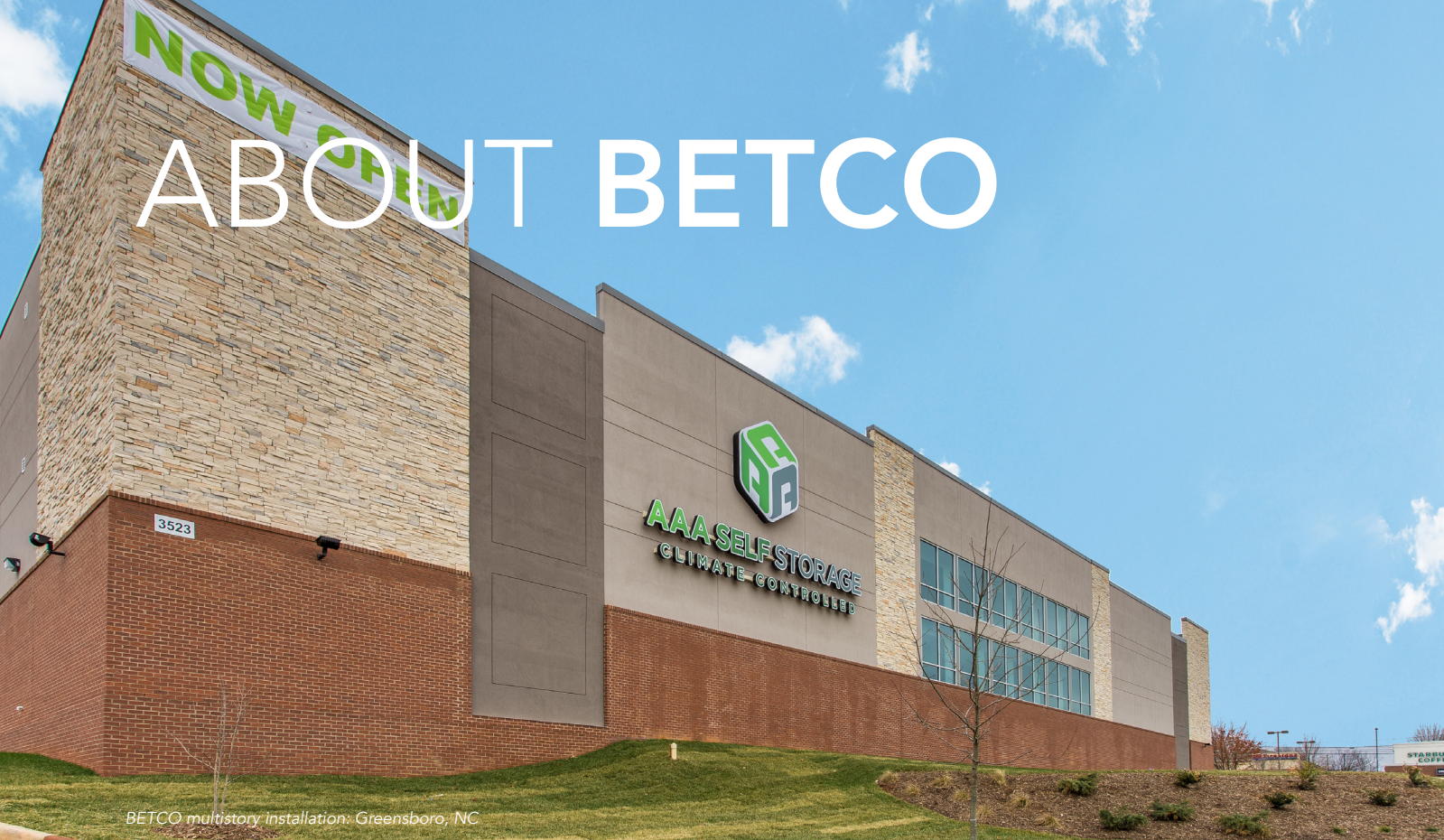
BETCO multistory installation: Greensboro, NC