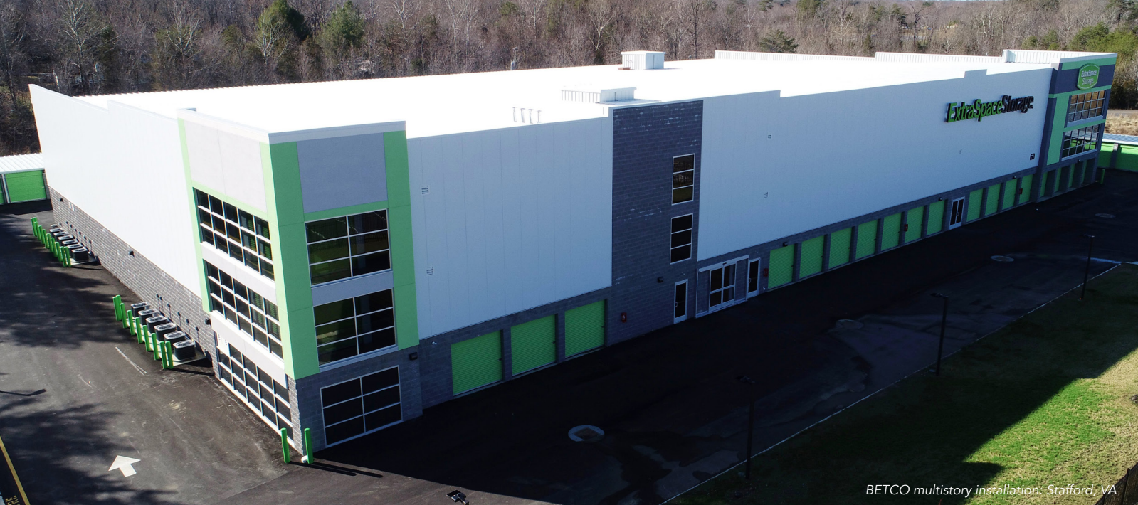
BETCO multistory installation: Stafford, VA