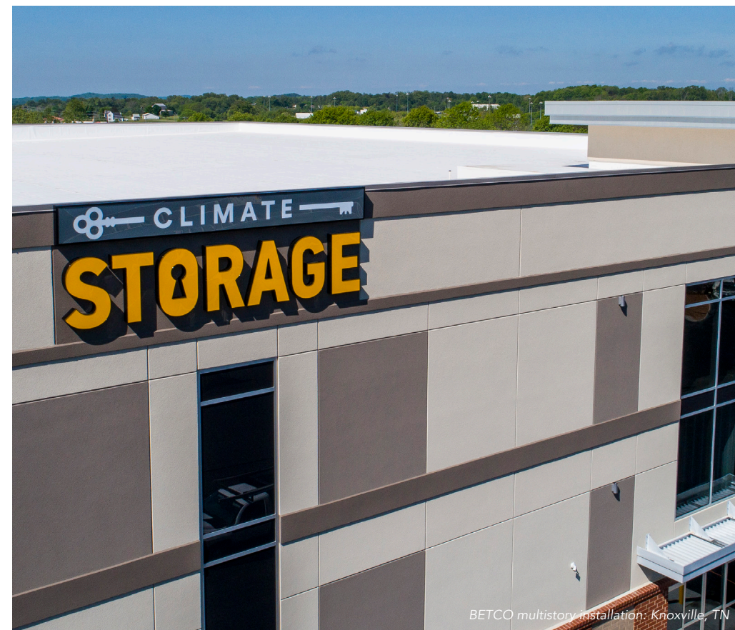
BETCO multistory installation: Knoxville, TN

There's no limit to what you can add, and customers are growing more accustomed to amenities. So if you can envision it, BETCO can build it.