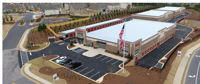
BETCO multistory installation: Johns Creek, GA

BETCO leads the industry in designing, manufacturing, and installing self-storage systems.