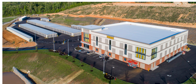
BETCO multistory installation: Knoxville, TN